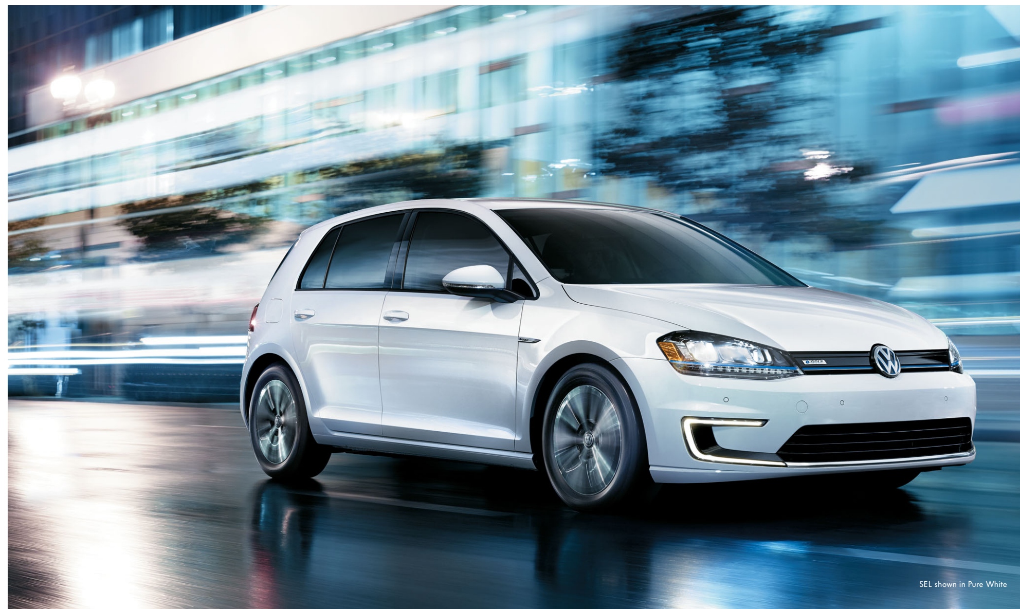
SEL shown in Pure White