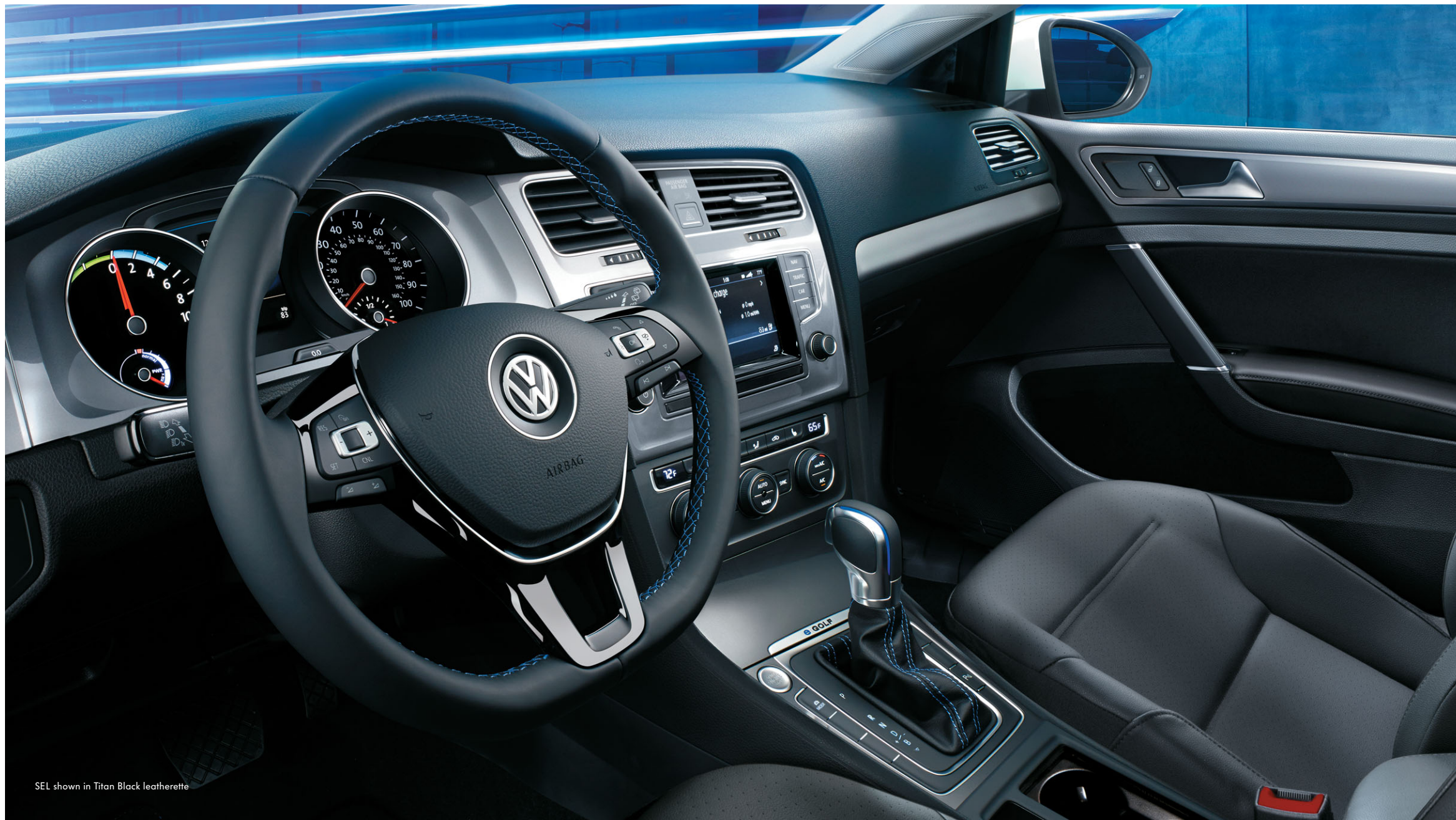
SEL shown in Titan Black leatherette